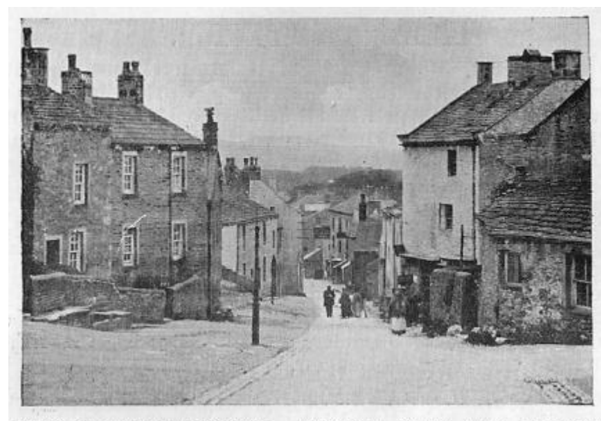
Main Street, Grassington. (Vickery, Kyrle & Co., London)

It is described as the largest town in Wharfedale north of Addingham, but until the beginning of the 19<sup>th</sup> century it could boast of no place of worship, the nearest being the Parish Church at Linton, built in 1180. Apart from Quaker meeting-houses, the nearest Nonconformist Chapel was at Winterburn, which was erected in 1704. It is said that friends from Grassington occasionally attended Winterburn Chapel in the latter half of the 18th, and the beginning of the 19th centuries, and that lay-helpers from the Church there, and from the Congregational Chapel at Skipton, frequently held services in cottages, both at Linton and Grassington. Services, too, are recorded as being held on the banks of the Warp (Wharfe). Winterburn is 6 miles from Grassington, a good Sabbath day's journey.